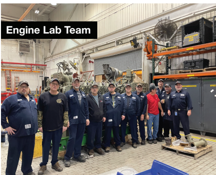
Engine Lab Team