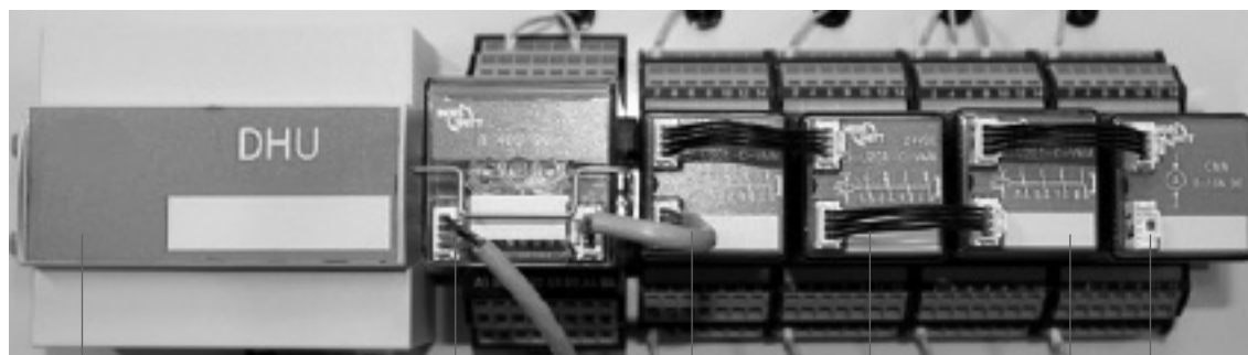
Data Handling Unit (DHU)

To address this need, Wabtec developed the Mors Smitt™ Relay Condition Monitoring System, which is used to analyze the condition of relays and connected devices in real-time and identify the accurate timing for part replacements. The result: reduced service costs and increased train control availability.