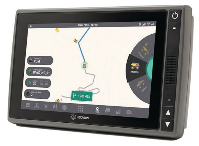
User interfaces should provide clear, context-specific alerts, enabling operators to respond effectively to collision threats. Pictured: Hexagon's Core display.

have been noticed, for example, between a safety event or breakdown in a particular location and the equipment or road condition. "Often, mines never identify the root cause of such issues, but the extra level of insight that connected processes provide can help address this."