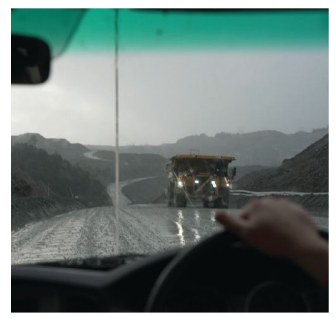
Autonomous haulage systems appear to offer a route to reduce the risk of collisions significantly, as they remove the primary contributing factor to accidents: human error.

This could mean "non-autonomous vehicles being able to maintain greater optimum speeds when in the autonomous zone, for example, or having shorter following distances than are currently allowed," continued Savit. "The situation